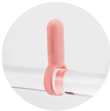
Elongated Vibrating Product Body for Clitoral Stimulation