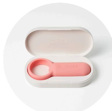
USB-C Charging Case