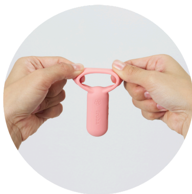
Stretchable Silicone Ring that Fits Most Penis Sizes