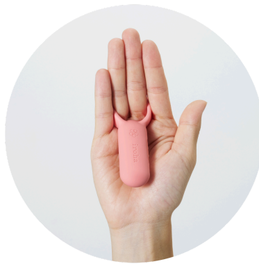
Loop around Fingers for Stimulating Touch