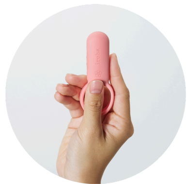
Hold for Pinpoint Stimulation